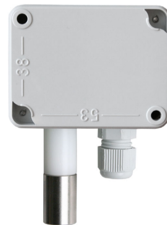
Fig. 2 Rear view with dimensioning of openings for mounting