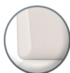
Ref: B100PBS-RS-EH Silver - ABS