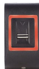
Red LED blinking Access Denied