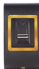
Orange LED Idle Mode