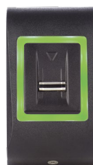
Green LED Access Granted