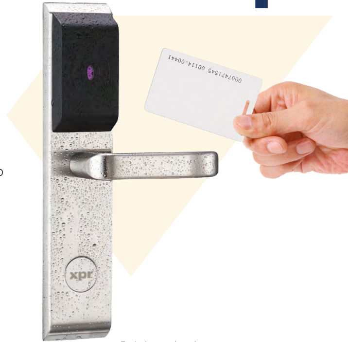
For indoor and outdoor use

It supports Mifare Classic 1K and 4K memory cards. It can store up to 3500 events in its memory and 500 cards in its blacklist, with unlimited user capacity.