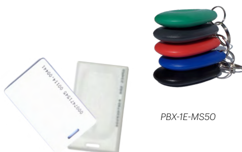
PBX-2C-MS50 PBX-2-MS50 & PBX-2-MS70